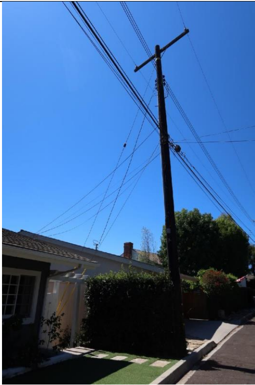
IA1Img1: View showing not tightened guy wires