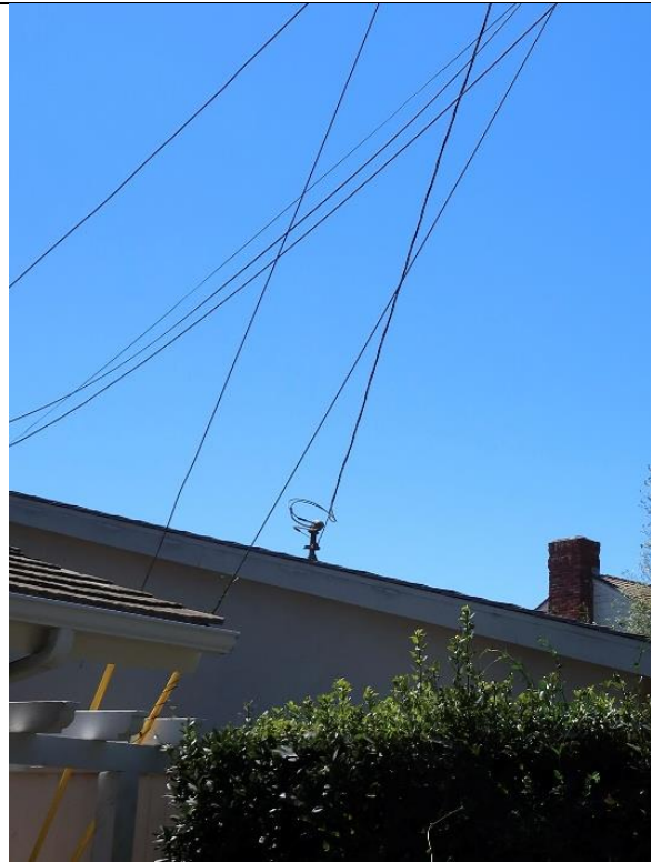
IA1Img2: View showing down guy not tightened