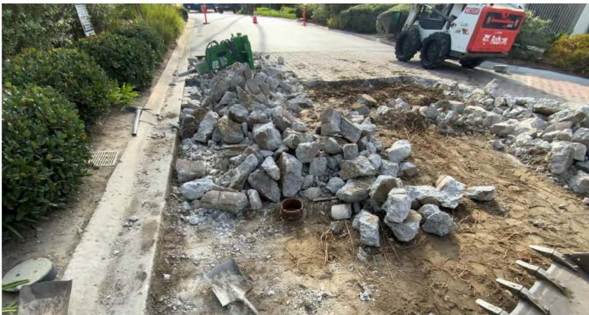
Photo 2: Photo provided by the Olivenhain Municipal Water District of incident area and damaged facility. The skid steer and jackhammer attachment are visible towards top of the photo.

The notification from the reporter, Westbrook, stated that Agundez was excavating pavers, while the general contractor, Nautilus, stated via email that Agundez was removing and excavating in the concrete. (Exh. 1, 3.) Agundez stated in the interview that Agundez Concrete Company was excavating with a power tool, a bobcat, to remove concrete and was aware of the valve covers in the concrete. (Exh. 10.)