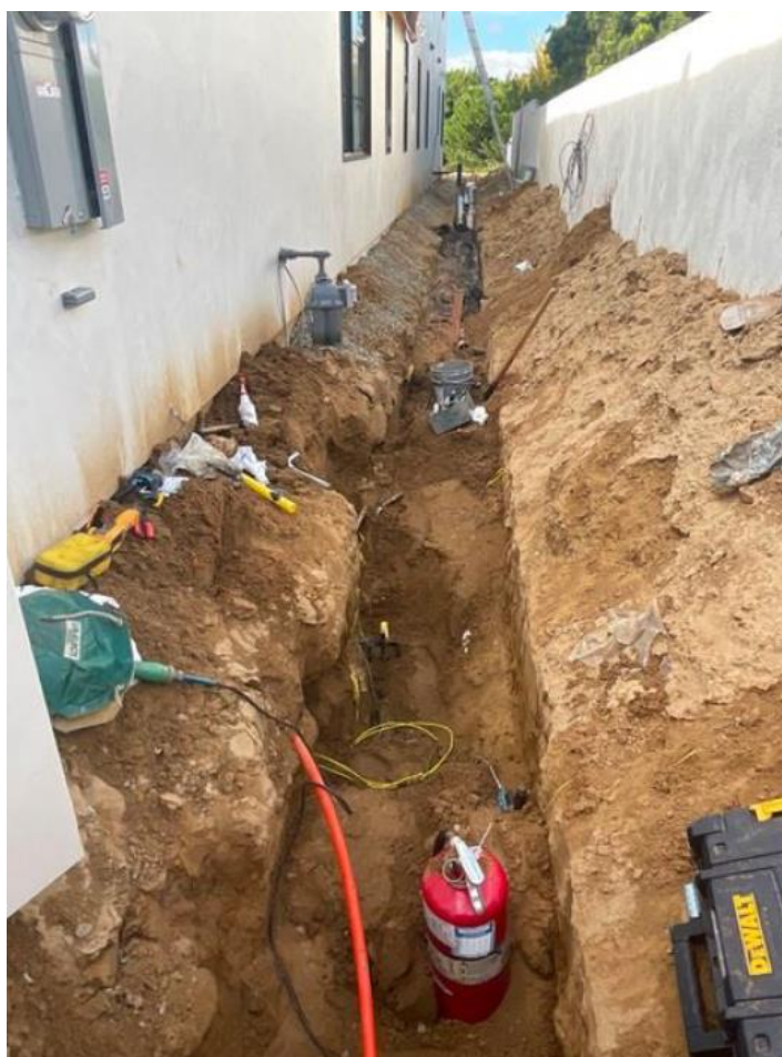
Photo 1: Photograph provided by Southern California Gas Company showing a trench near a gas meter and a hand tool next to a bucket in the background. (Exh. 1.)

On November 29, 2023, VEL Construction, as a subcontractor for Streamline Construction, Inc., was trenching with a shovel for drainage work when they damaged a plastic natural gas facility. (Exh. 1.)