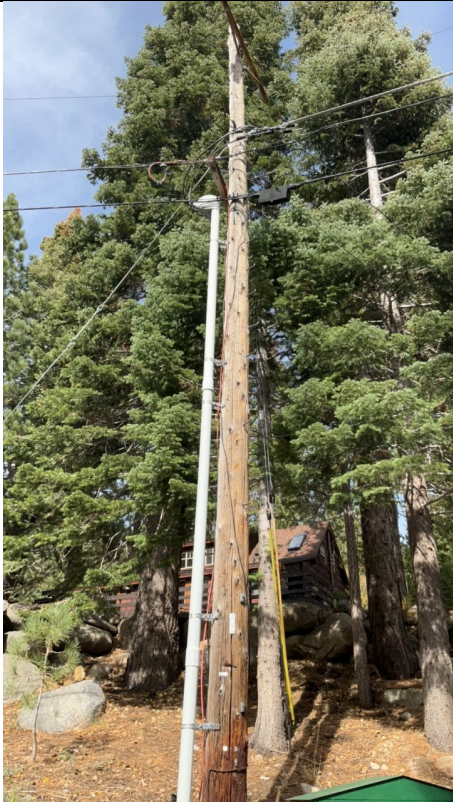
Item1IA1mg1: Pole not repaired or replaced.