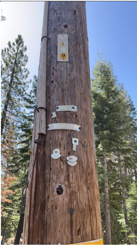
Item1GImg2: Pole ID