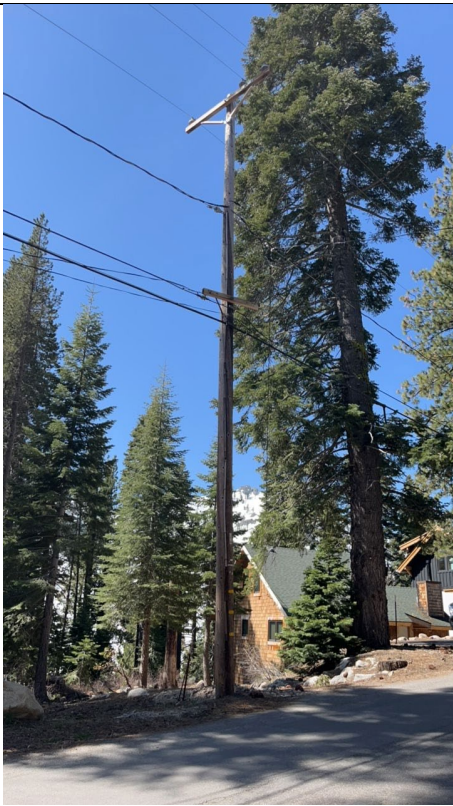
Item1GImg1: Overall Pole