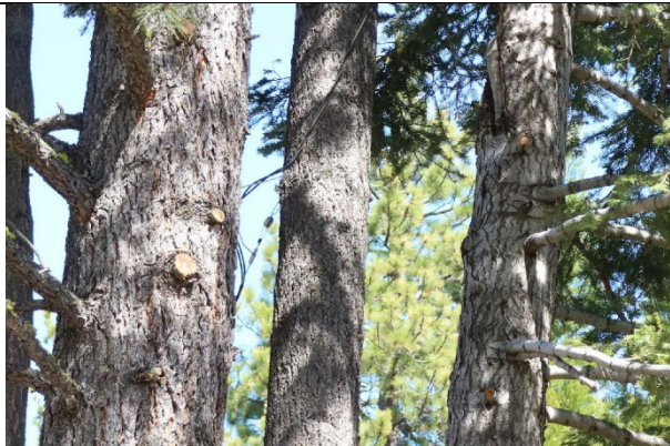
Item1IA1Img2: Conductor installed to tree attachment