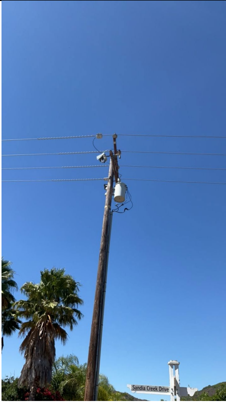
IA1Img1: View showing no wildlife covers