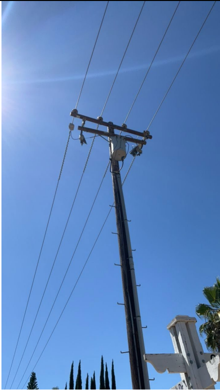
IA1Img3: View showing no wildlife covers