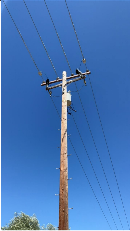
IA1Img2: View showing no wildlife covers