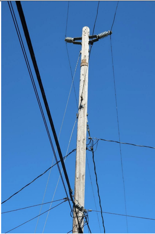
Item1IA1Img1: View of pole with no electrical equipment observed.