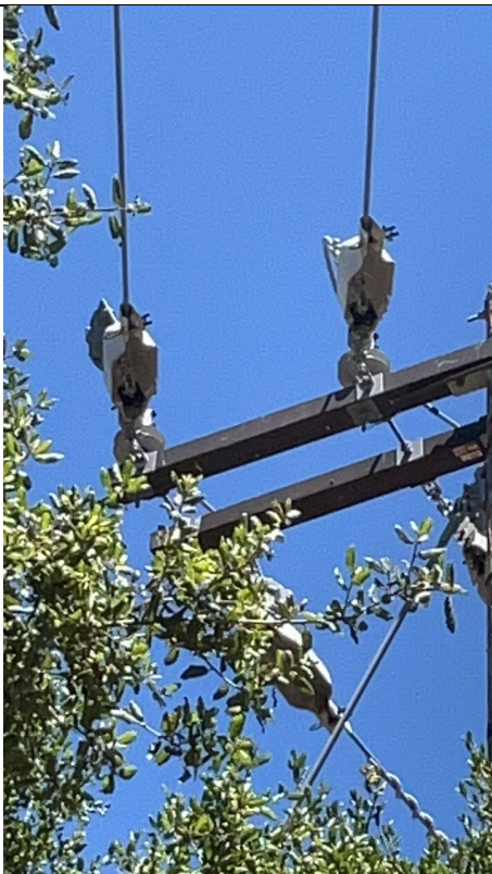
IA1Img3: View showing missing wildlife connector cover