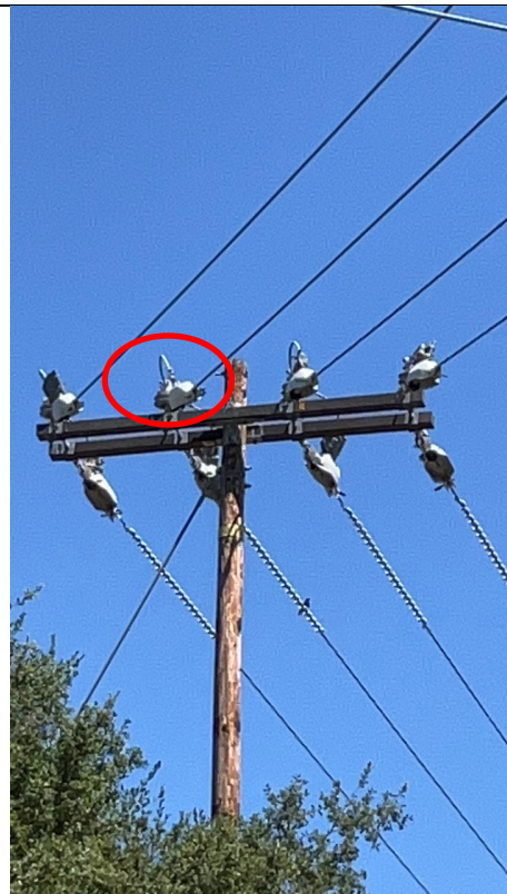
IA1Img4: View showing missing wildlife connector cover