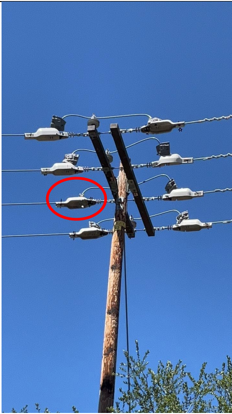
IA1Img1: View showing missing wildlife connector cover