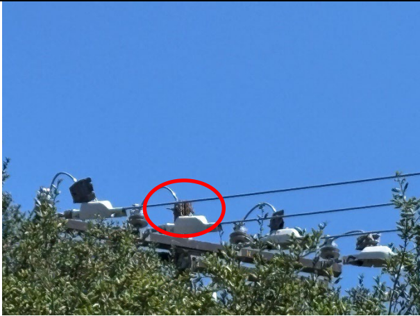
IA1Img5: View showing missing wildlife connector cover