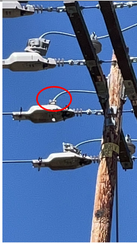
IA1Img2: View showing missing wildlife connector cover