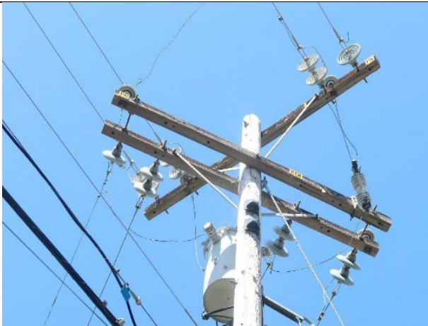
Item1IA1Img3: Non-exempt expulsion fuse