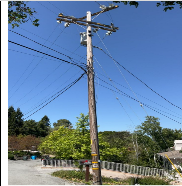
Item1IA1Img1: General area