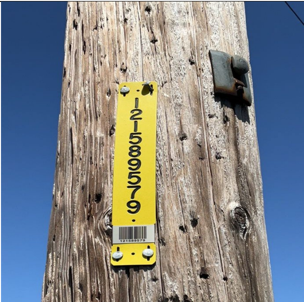
Item1IA1Img2: Pole ID