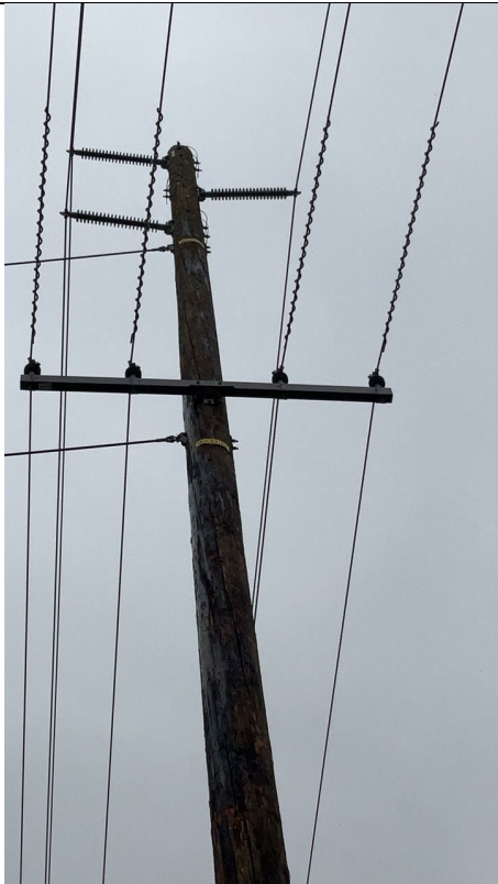
Item1IA1mg1: View showing no wildlife covers installed