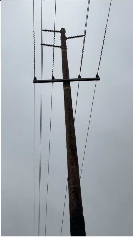
Item3IA1mg1: View showing no wildlife covers installed