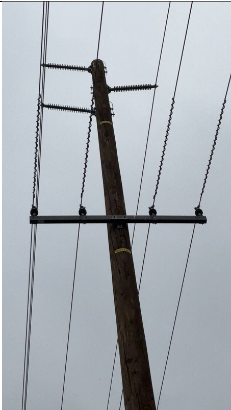
Item2IA1mg1: View showing no wildlife covers installed