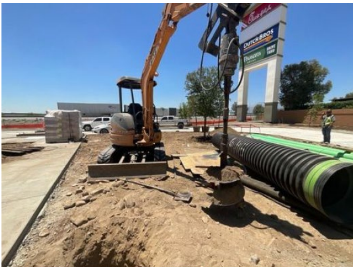
Photo 2: Photograph provided by Southern California Gas depicting the equipment used for auguring a hole. (Exh. 1.)

Southern California Gas Company reported that a 1” plastic service gas facility was damaged while auguring to install light poles and that the repairs completed on July 19, 2024, at 2:00 p.m. (Exh. 1.)