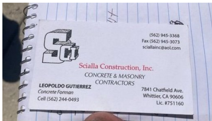
Photo 1: Photo provided by Southern California Gas Company on July 19, 2024, at 8:15 P.M., of the excavator's business card. Cropped by investigator. (Exh. 1.)

Government Code section 4216(h) defines an excavator to be "any person, firm, contractor or subcontractor, owner, operator, utility, association, corporation, partnership, business trust, public agency, or other entity that with their own employees or equipment performs, any excavation."