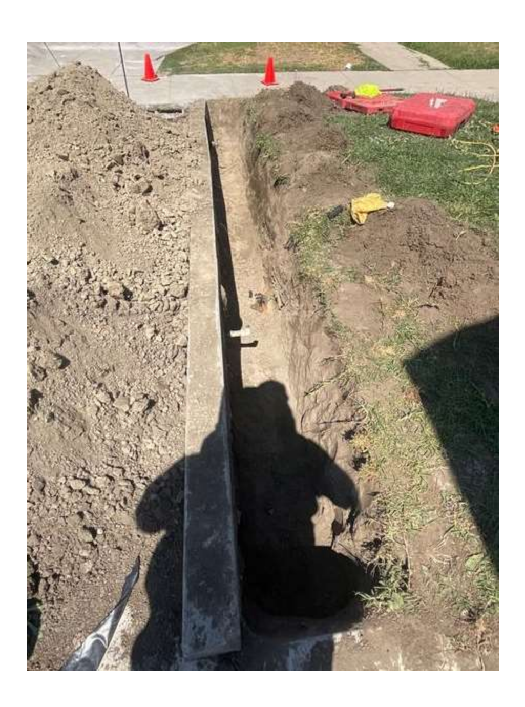
Date and time photographed