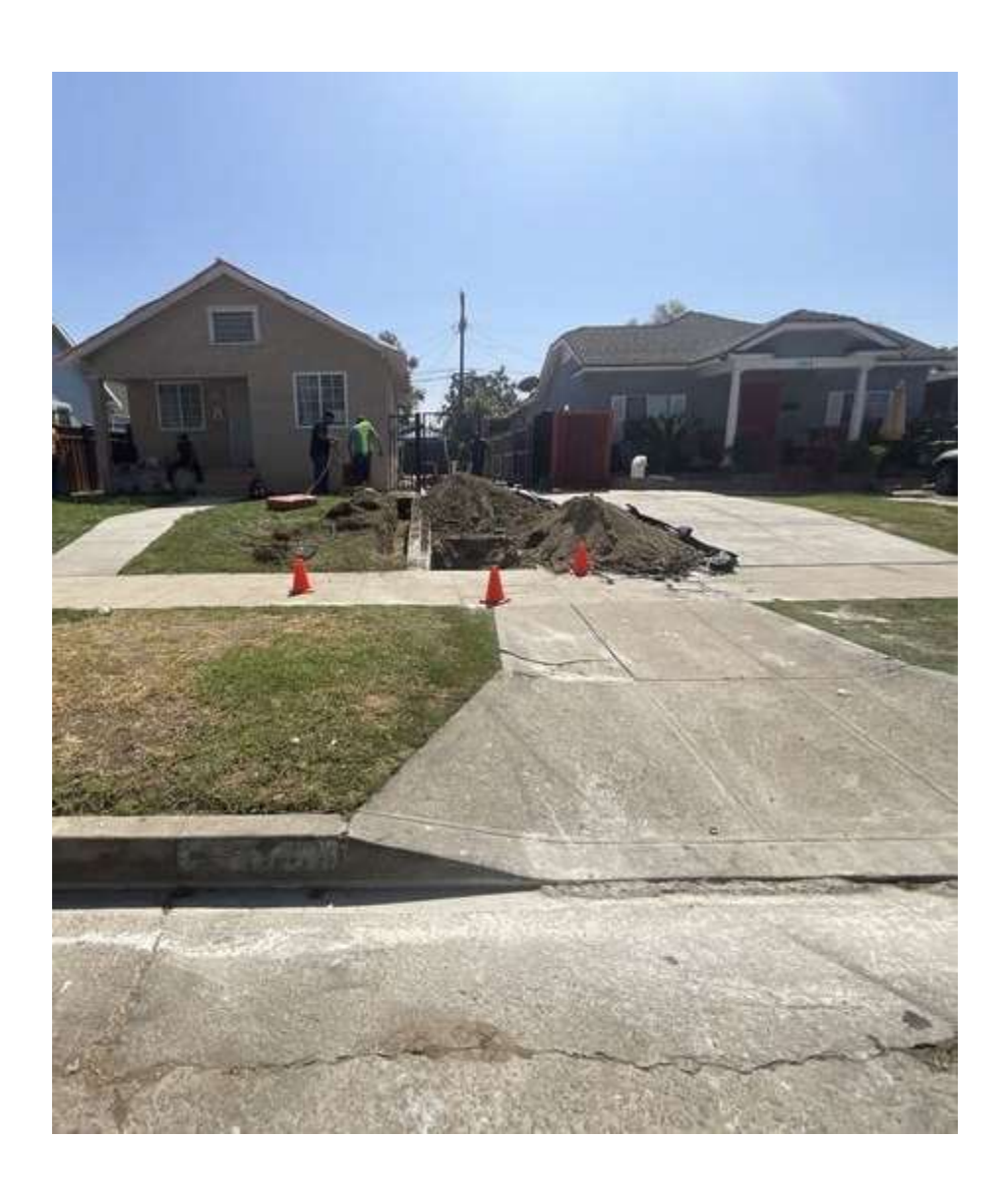
Date and time photographed