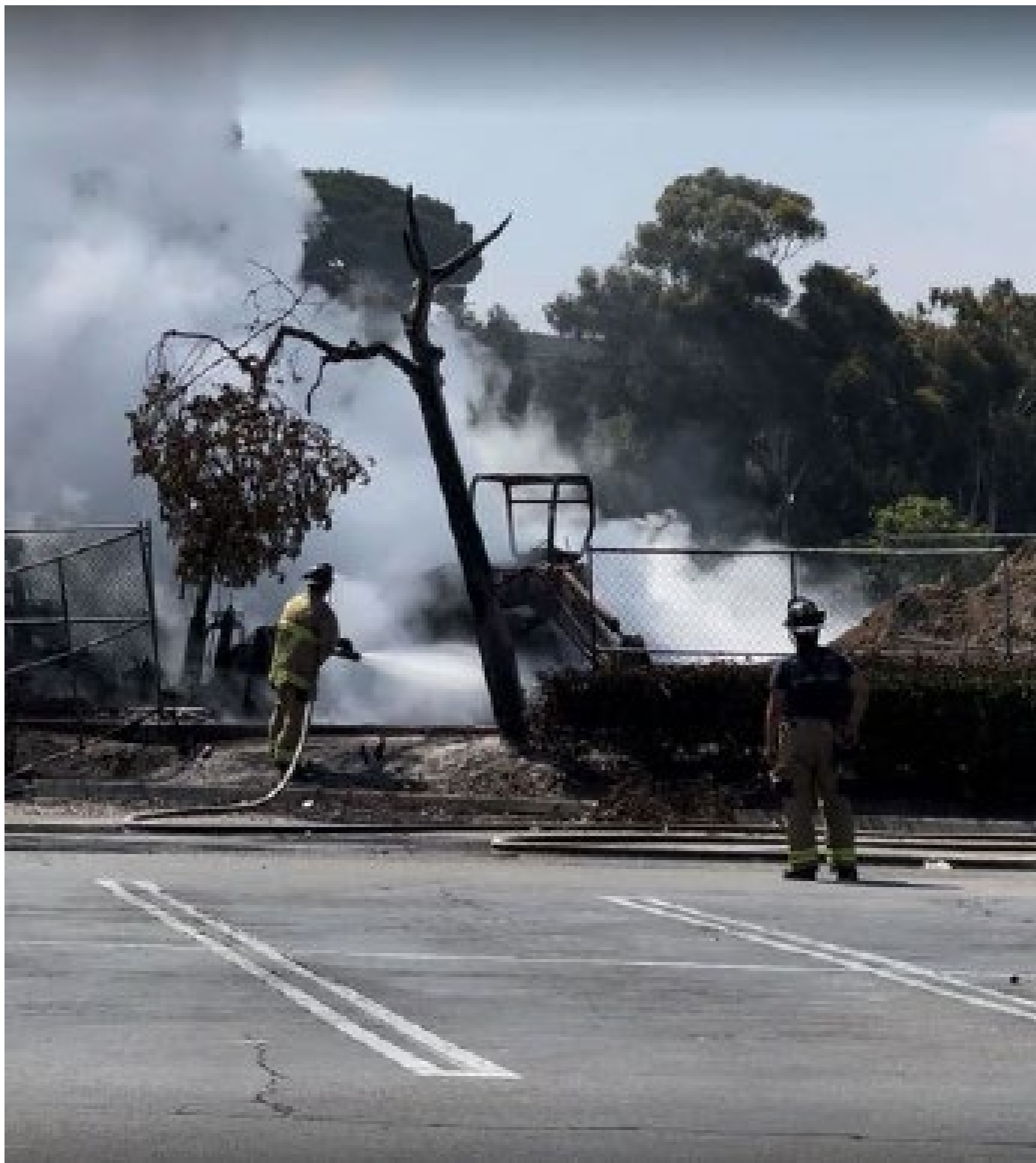
Photo 2 shows National City Fire Crew spraying water over equipment damaged by explosion. (Exh. 1).