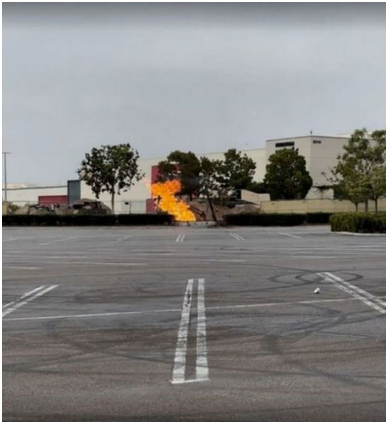
Photo 1 depicting the ignition. (Exh. 1.)