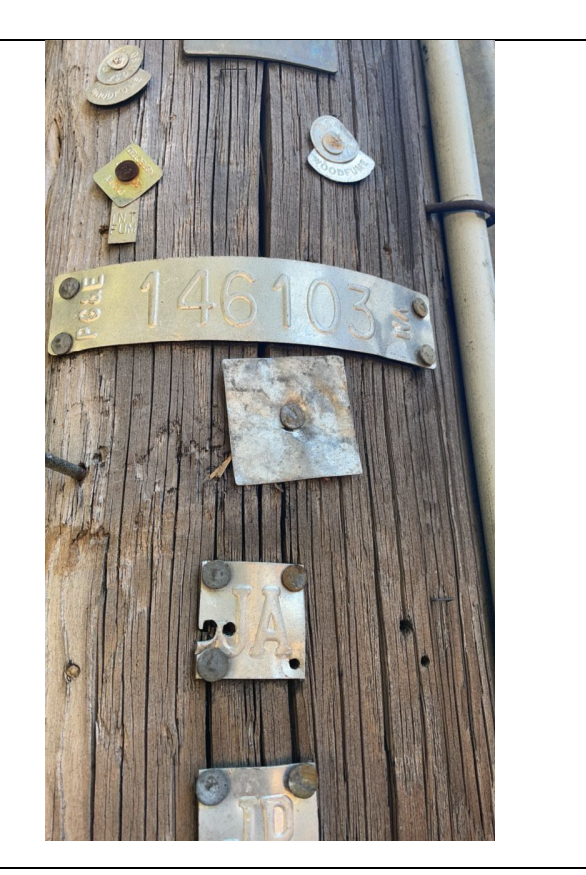
Item1GImg2: Pole ID.