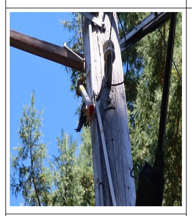
Item1IA1Img3: Hanging CalFIRE-exempt fuse.