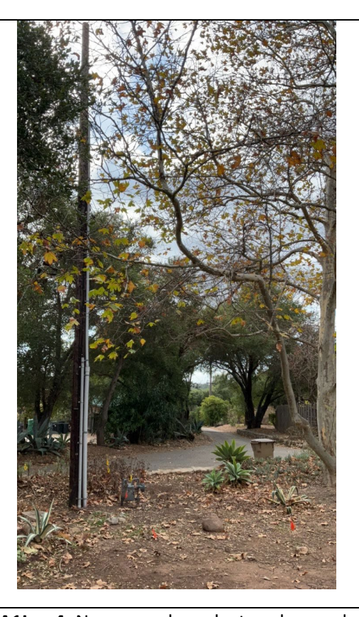
Item1IA1Img4: No covered conductor observed