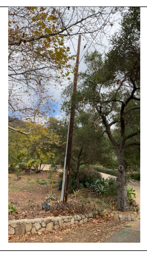
Item1IA1Img2: No covered conductor observed