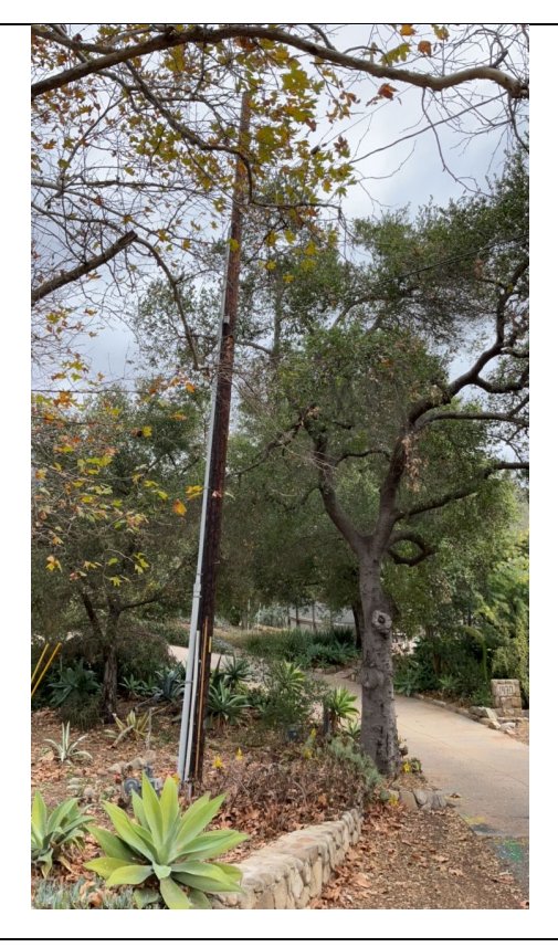
Item1IA1Img1: No covered conductor observed