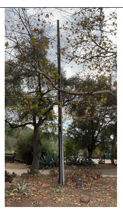
Item1IA1Img3: No covered conductor observed