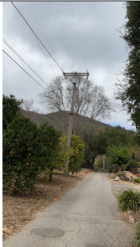
Item1IA1Img4: No covered conductor observed