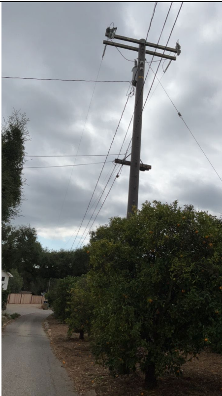
Item1IA1Img3: No covered conductor observed