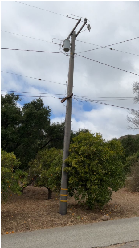
Item1IA1Img1: No covered conductor observed