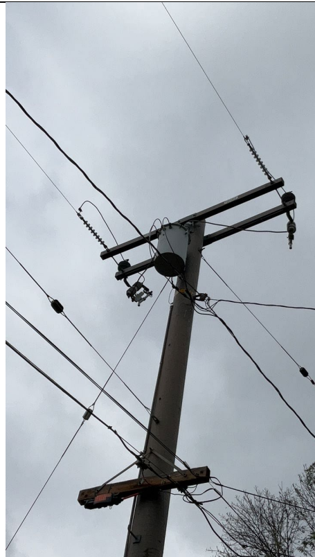
Item1IA1Img2: No covered conductor observed