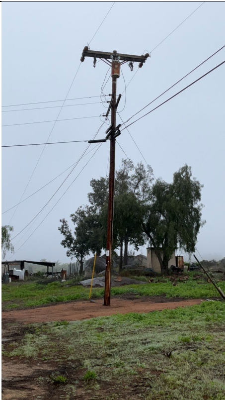
Item1GImg1: Overall Pole