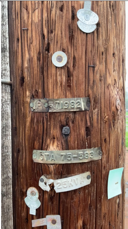
Item1GImg2: Pole ID