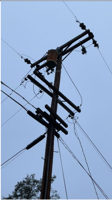
Item1IA1mg1: CAL FIRE-approved lightning arrester not installed