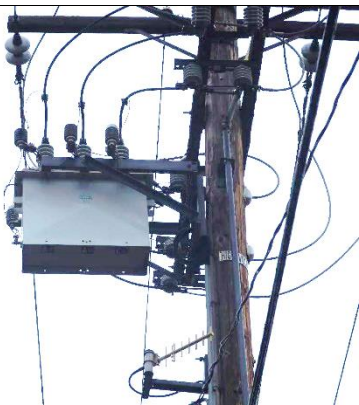
Item1IA1Img1: CAL FIRE-approved lightning arresters not installed