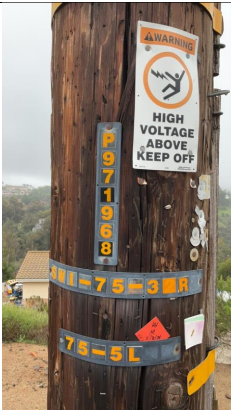
Item1GImg2: Pole ID