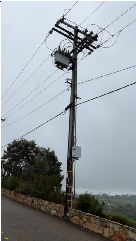
Item1GImg1: Overall Pole