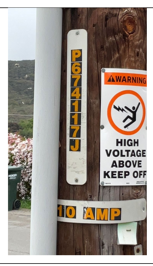
Item1GImg2: Pole ID