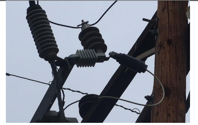
Item1IA1Img4: Missing lightning arrester cover