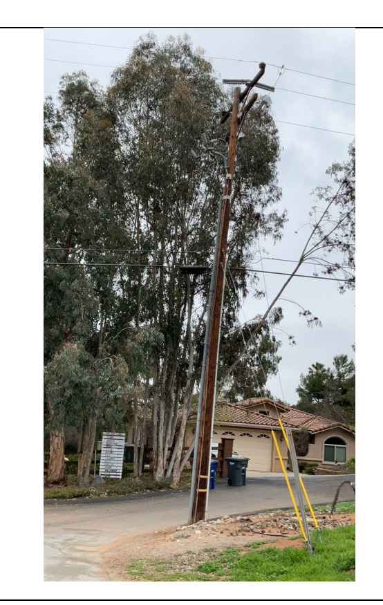
Item1GImg1: Overall Pole