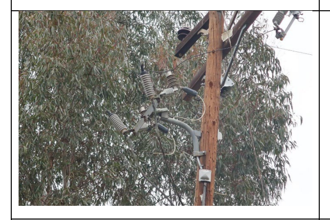
Item1IA1Img1: Missing lightning arrester cover