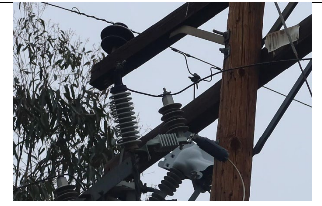
Item1IA1Img2: Missing lightning arrester cover