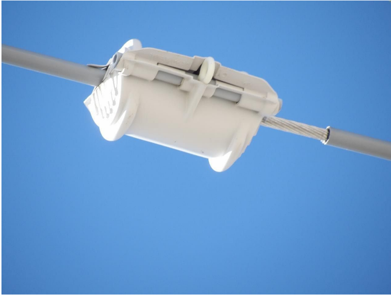
Item1IA1Img1: Close-up view of bare conductor outside of wildlife cover.