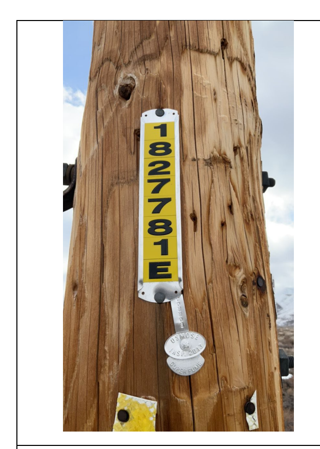
Item1GImg1: Pole ID.