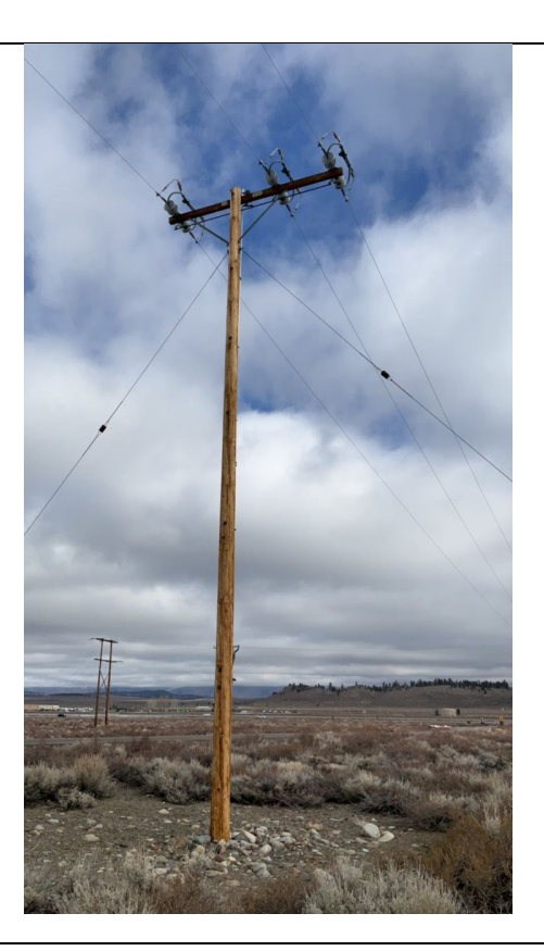
Item1GImg2: Overall pole.