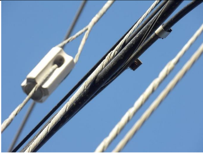
Item1IA2Img1: Close-up view of guy in contact with communications cable.