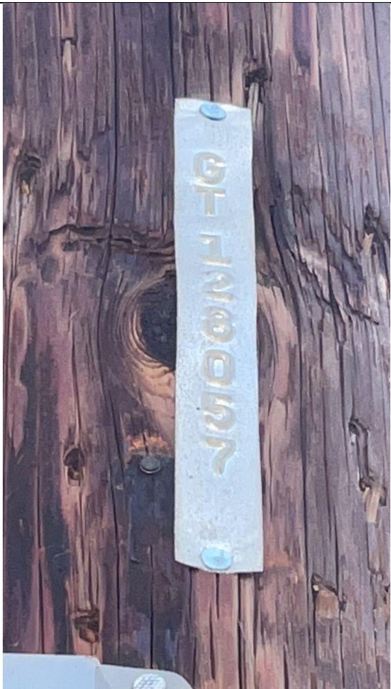
Item1GImg2: Pole ID.