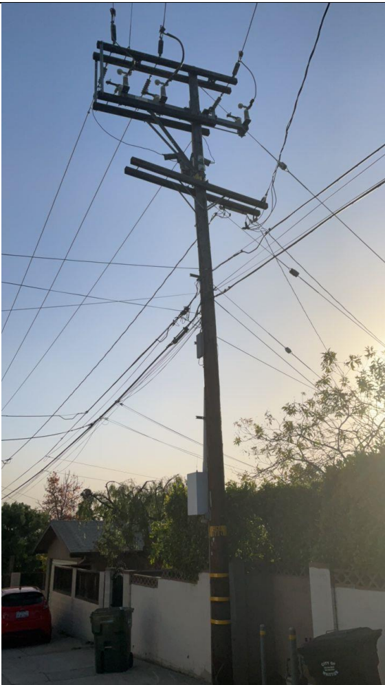
Item1GImg1: Overall pole.