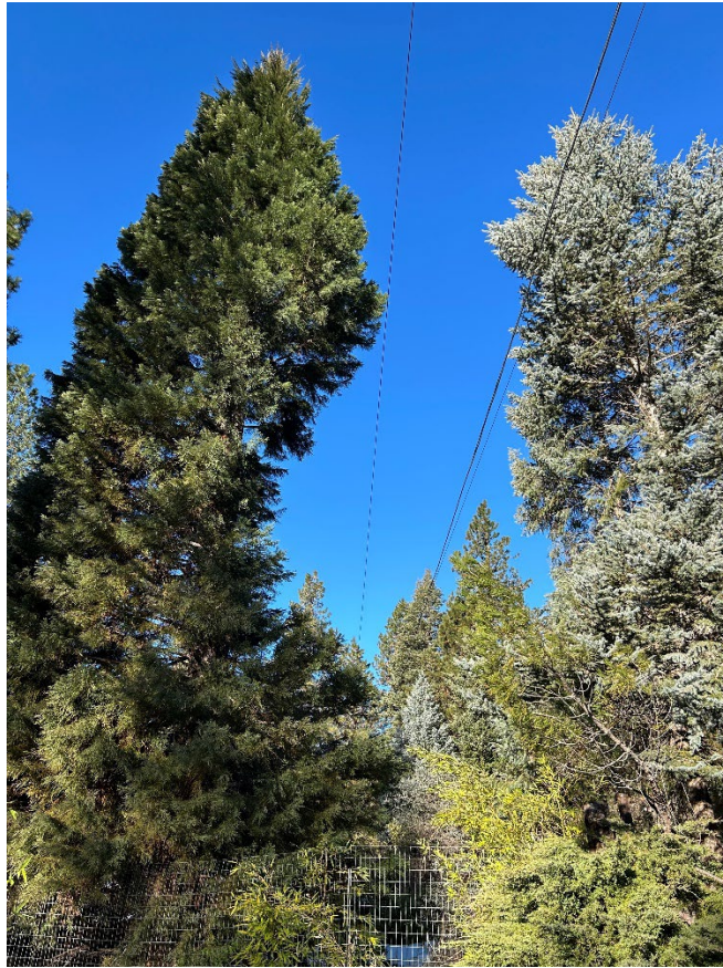
1- Before Pruning Near Pole ID 132403, at Coordinates 41.22475828, -122.14927276