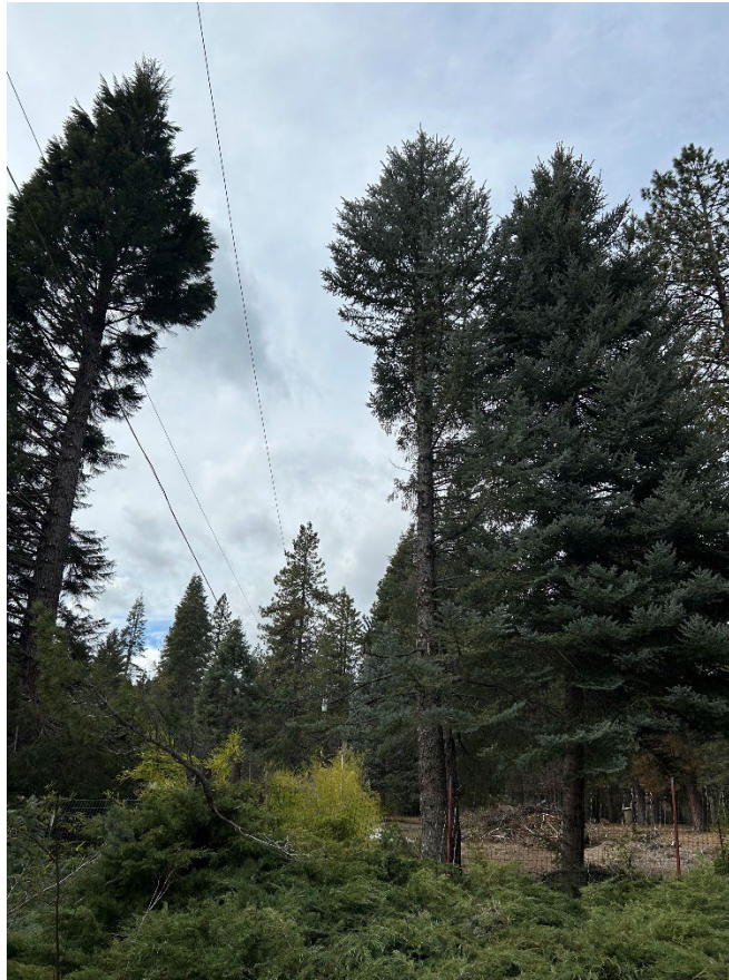
2 - After Pruning Near Pole ID 132403, at Coordinates 41.22475828, -122.14927276