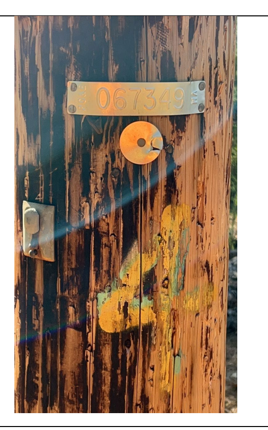
Item1GImg2: Pole ID