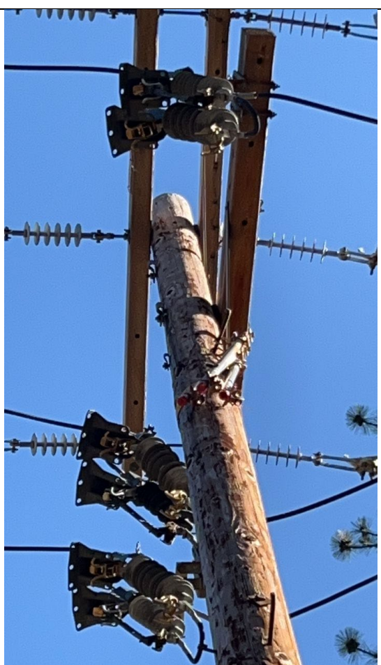
Item1IA1Img2: Three Fuse cutouts