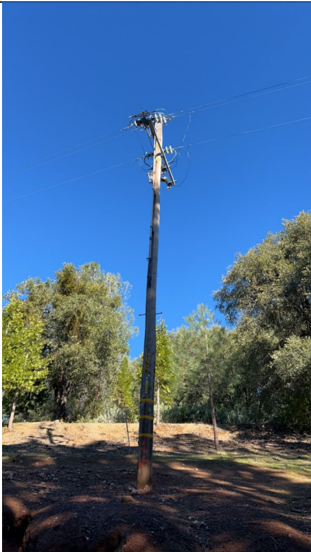
Item1IA1Img1: Overall pole