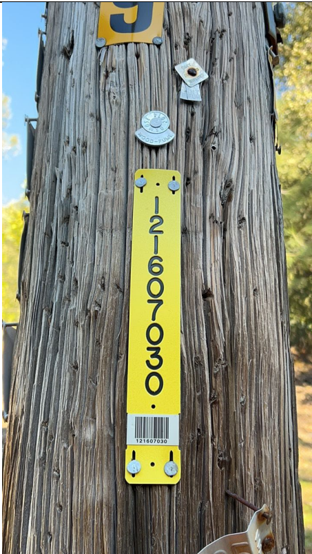
Item1IA1Img2: Pole ID