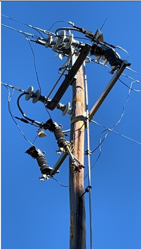
Item1IA1Img5: Empty fuse cutouts