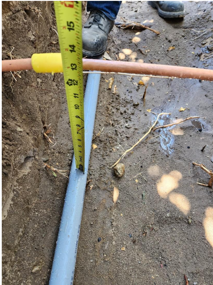
Photo 3 depicts the half-inch natural gas line. (Exh. 4.)