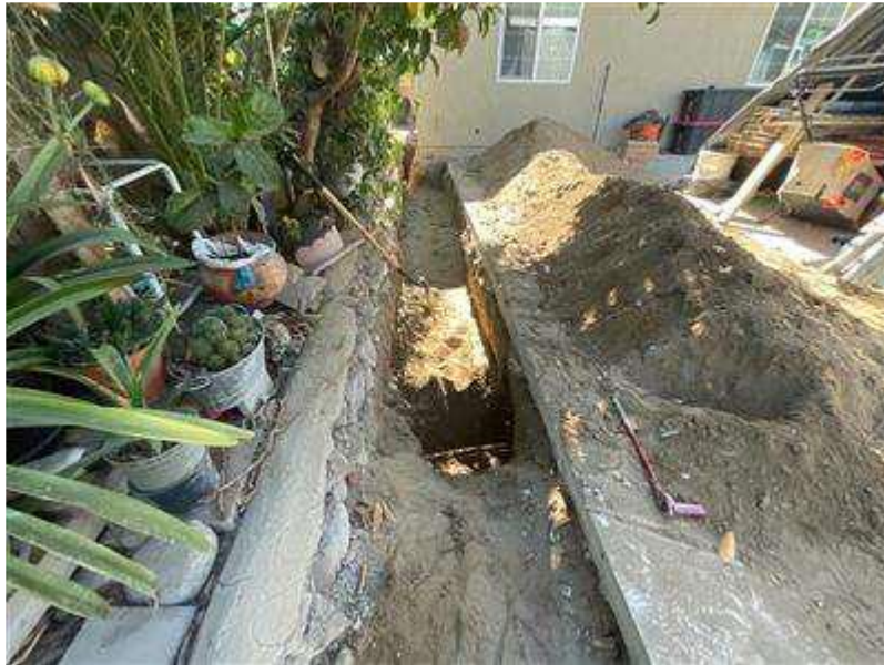
Photo 1 provided by Southern California Gas Company depicts the backyard jobsite. (Exh. 1.)