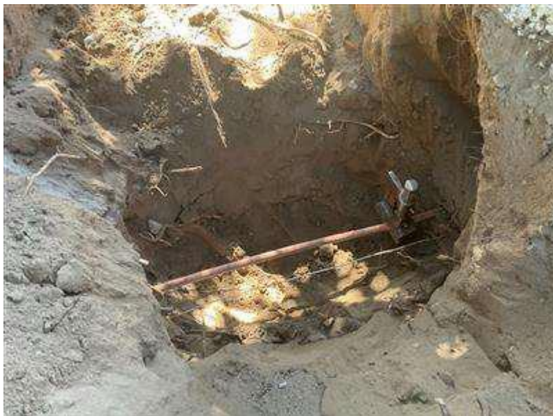
Photo 2 depicts the half-inch natural gas line. (Exh. 1.)