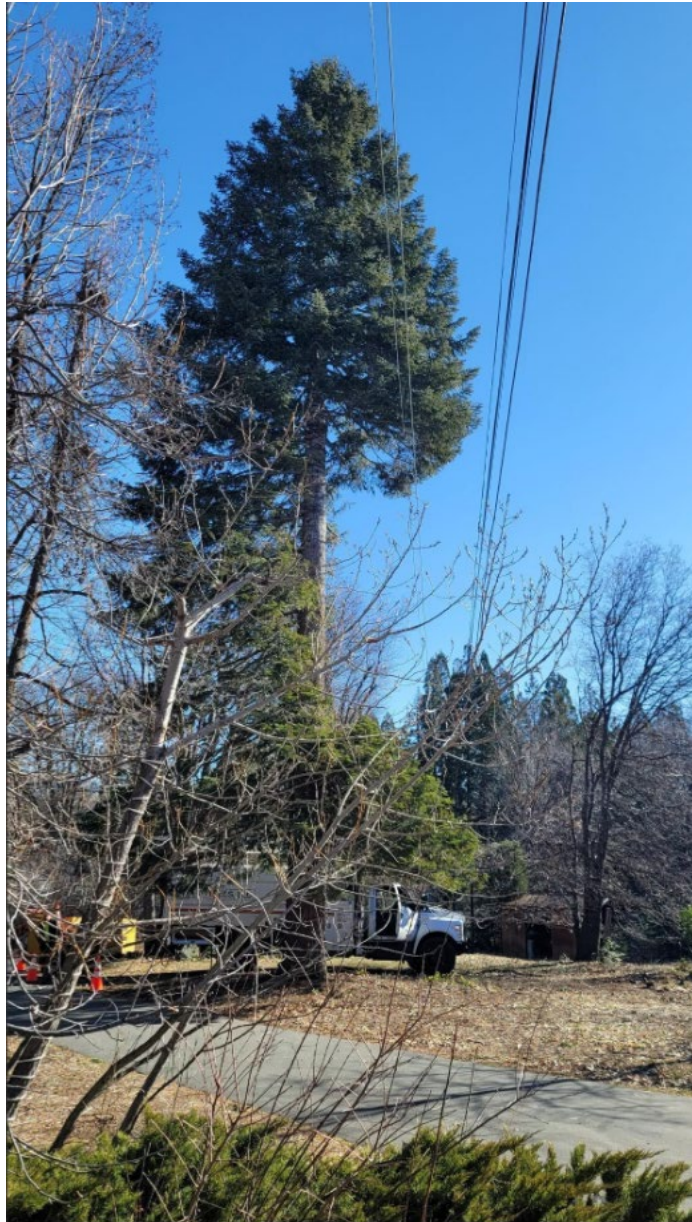
1 - Before Pruning