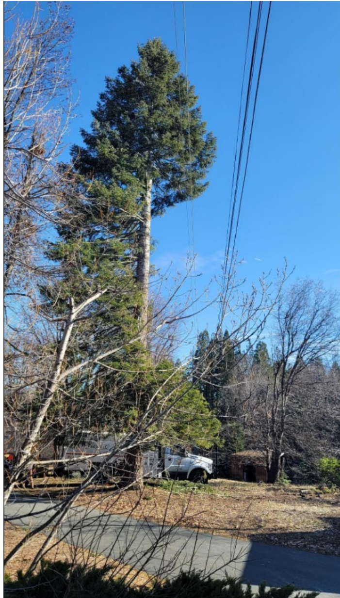
2 - After Pruning