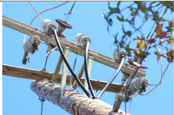
Item1IA1mg2: Two of the three non-exempt fuses