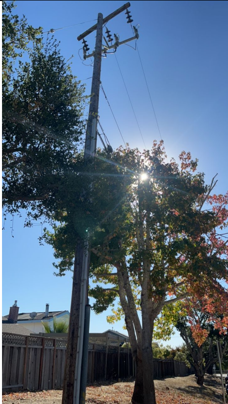
Item1G1mg1: Overall Pole