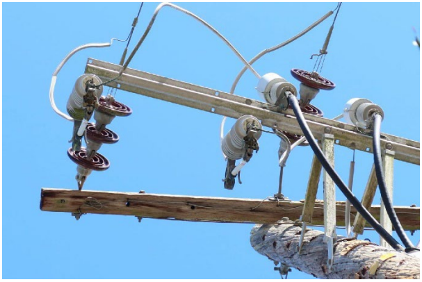
Item1IA1mg3: Two of the three non-exempt fuses