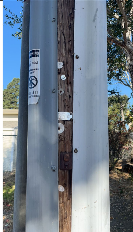
Item1G1mg2: Missing Pole ID