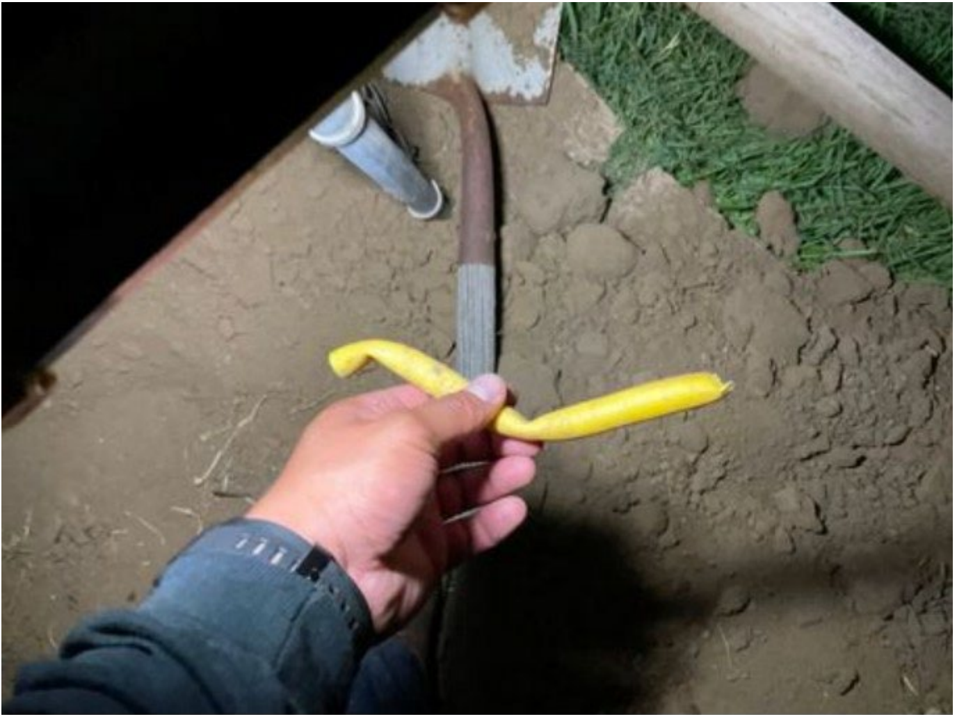
Photo 2 depicts a piece of the damaged natural gas line.