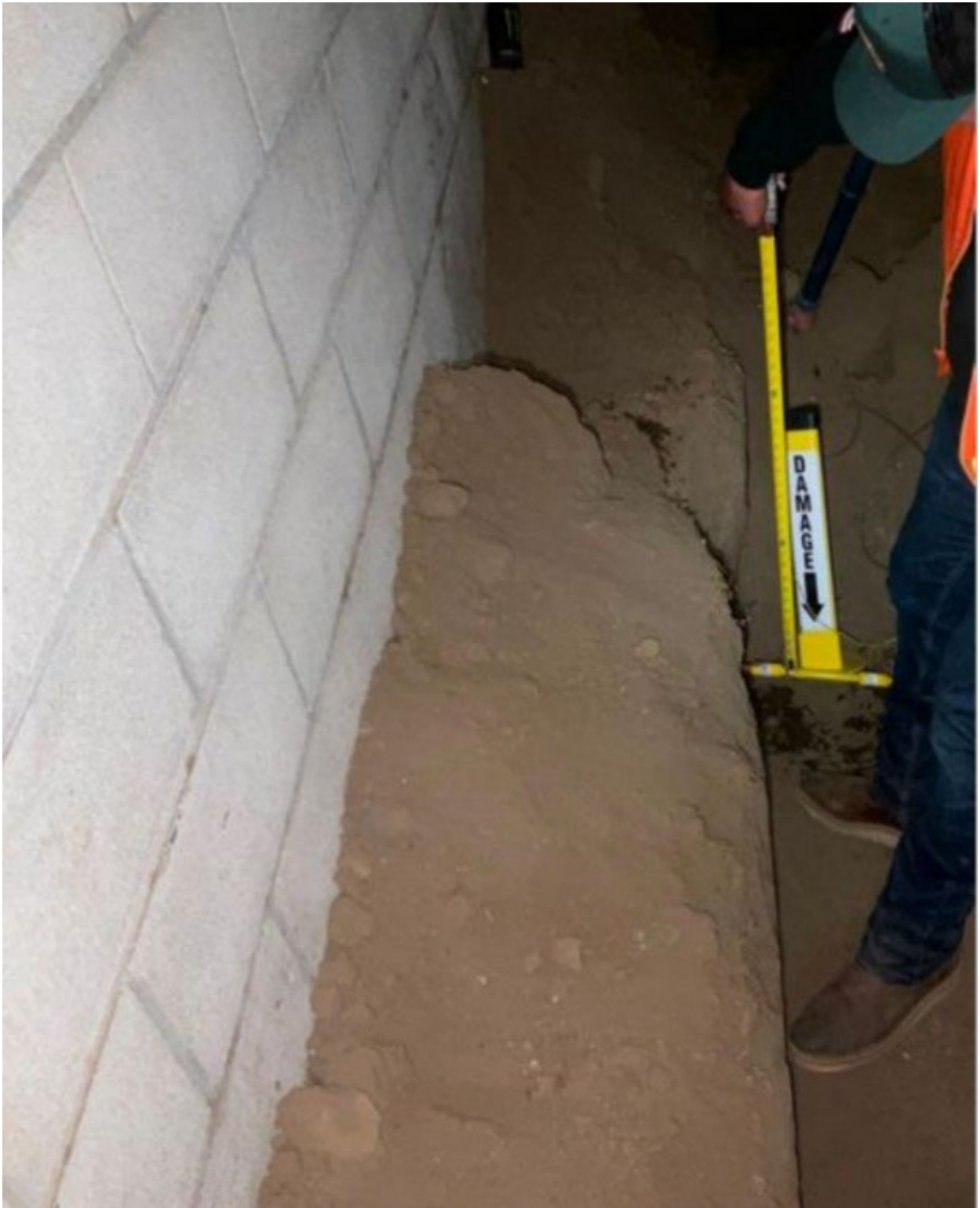
Photo 1, provided by the Southern California Gas Company, depicts the damaged natural gas line and the fence between jobsite, La Puente, California, and the next-door neighbor.