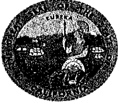
Exhibit 4 Interview w Novastar Ricky Vu