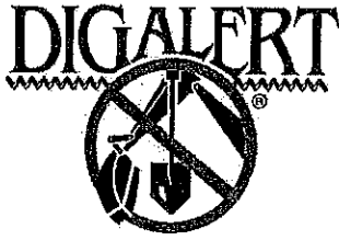
Exhibit 6 DigAlert No Ticket Response Underground Service Alert of Southern California™