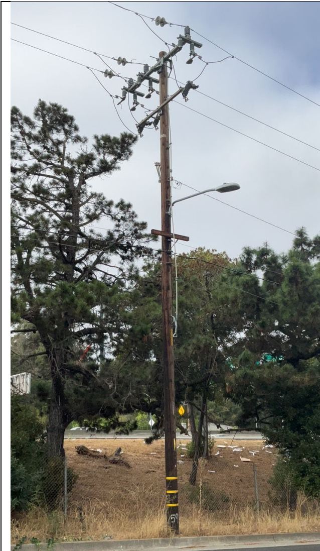
Item1IA1mg1: Overall area