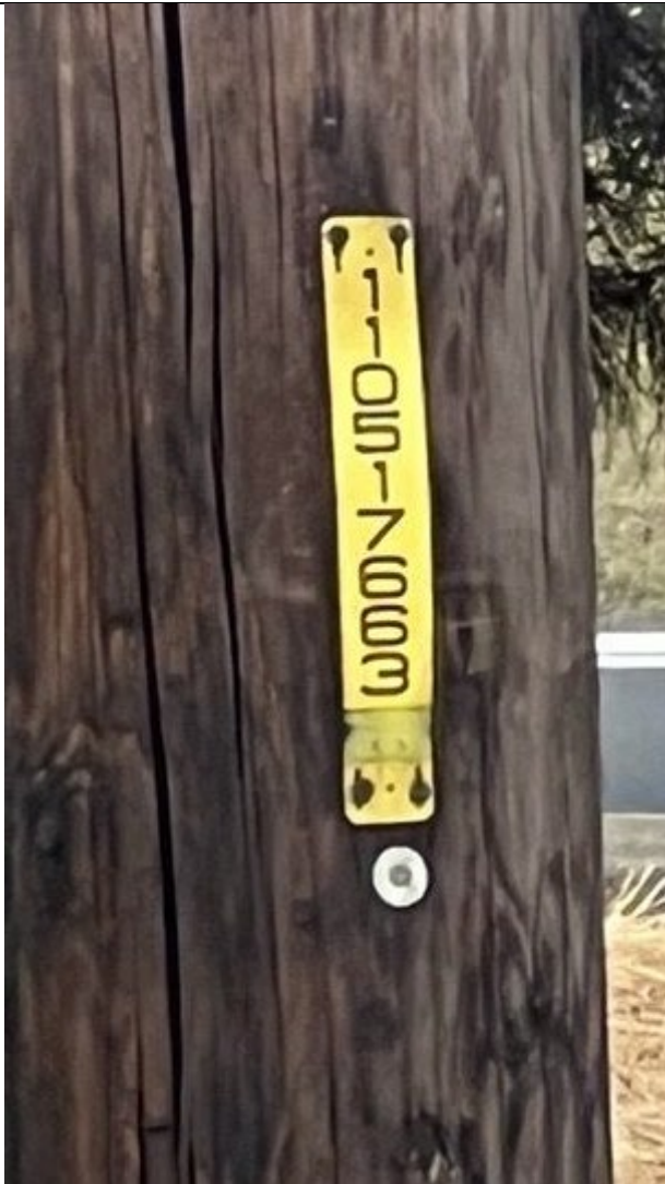
Item1IA1mg2 Pole ID