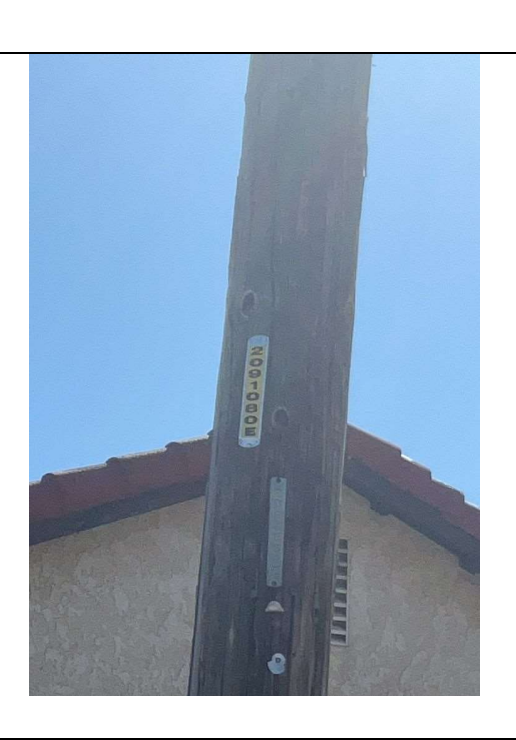
Item1GImg2: Pole ID