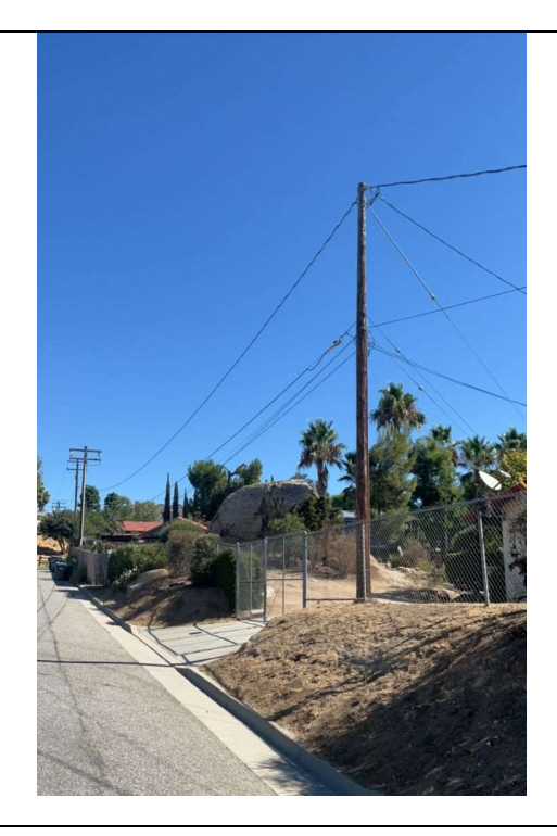
Item1IA1Img2: No covered conductor present