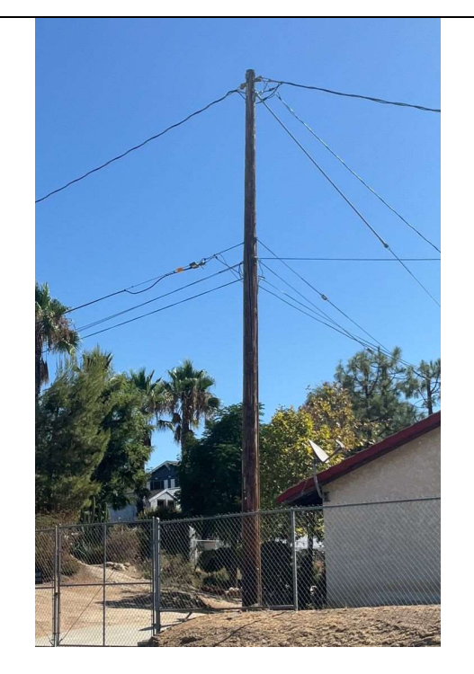
Item1IA1Img1: No covered conductor present