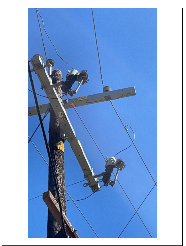
Item1IA1Img1 : View of non-exempt expulsion fuses