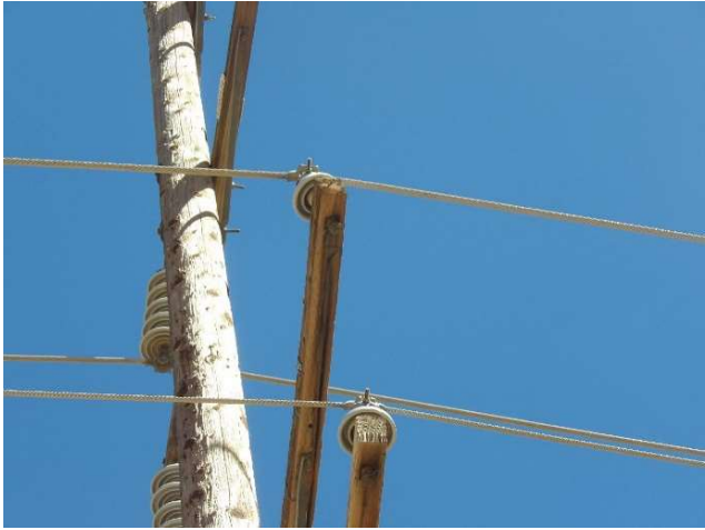
Item1IA1mg2: No Covered Conductor Present