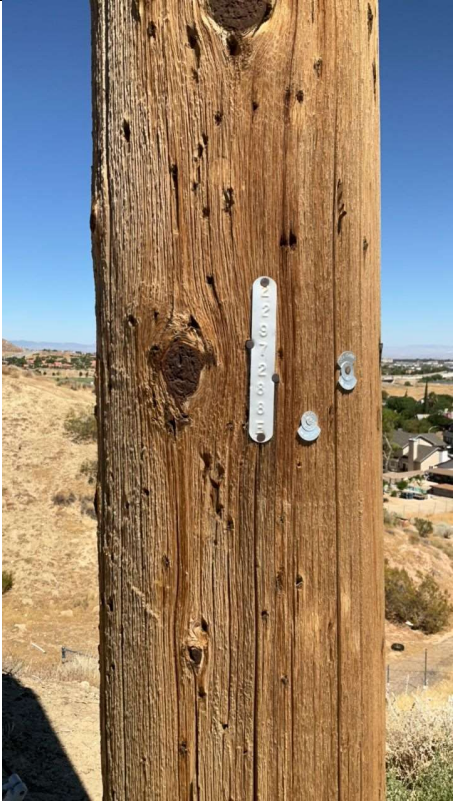
Item1G1mg2: Pole ID