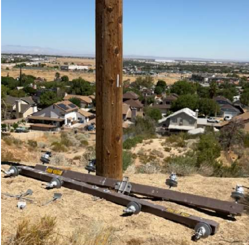
Item1IA1mg1: Crossarms Next to Pole