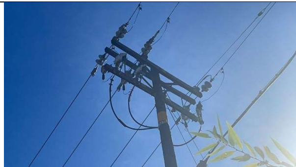
Item1IA1mg2: Avian protection is dislodged on the center phase, no other avian protections visible