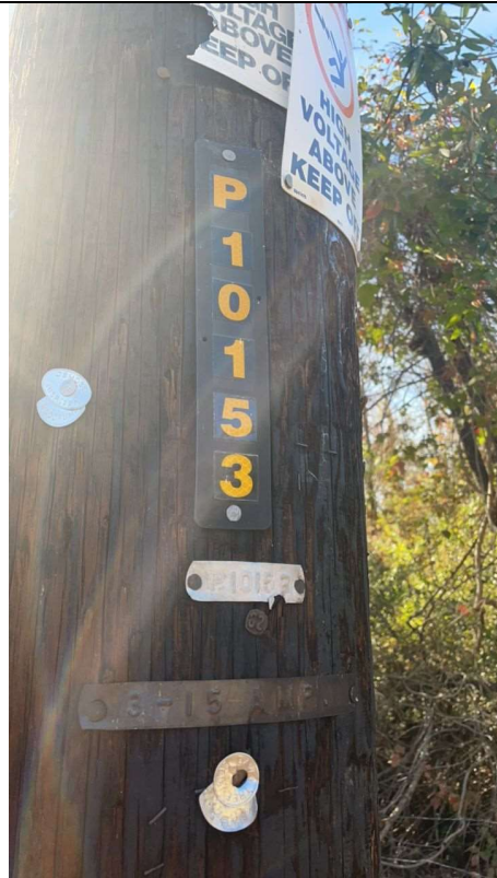
Item1G1mg2: Pole ID