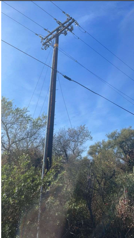
Item1G1mg1: Overview of pole