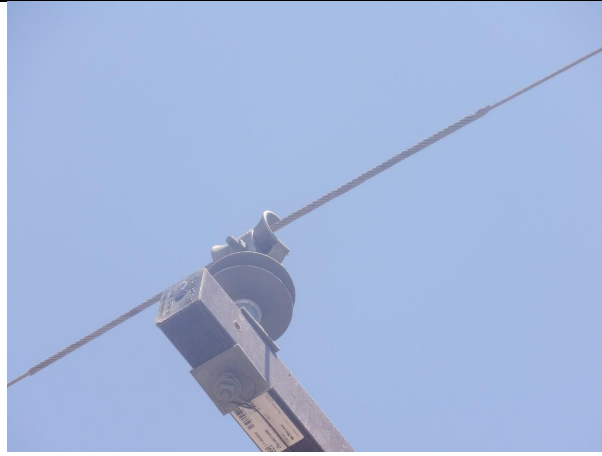
Item1IA1Img1: No covered conductor present