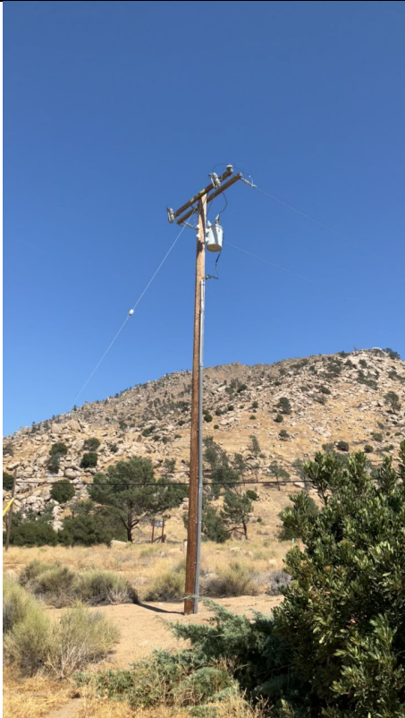
Item1G1mg1: Overall Pole