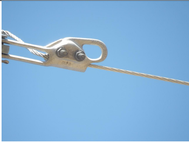
Item1IA1mg2: No Covered Conductor Present