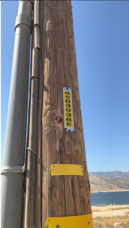
Item1G1mg2: Pole ID