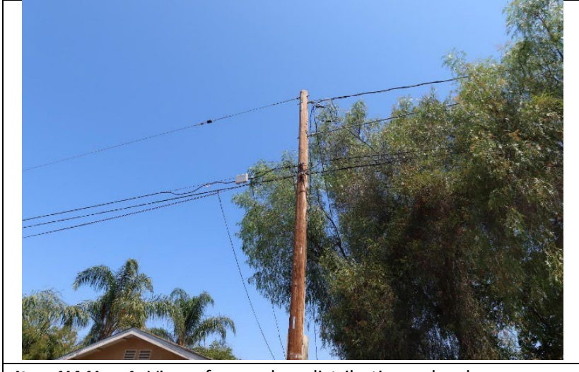
Item1IA1Img1 : View of secondary distribution pole where covered conductor installation was reported as installed.