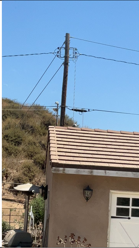
Item1IA1Img1: No covered conductor installed.