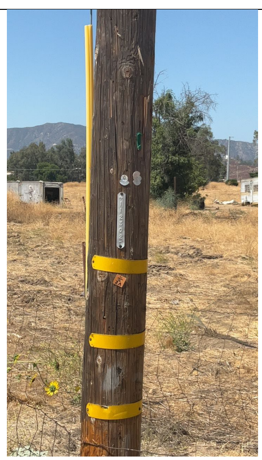
Item1GImg2: Pole ID