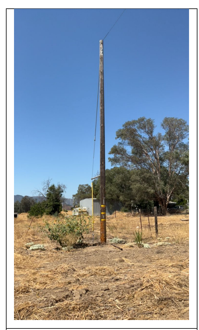
Item1IA1Img1: No covered conductor installed.