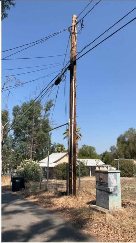
Item1IA1img1: No covered conductor present.