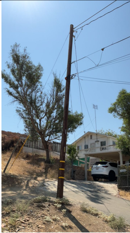
Item1IA1mg1: No covered conductor present.