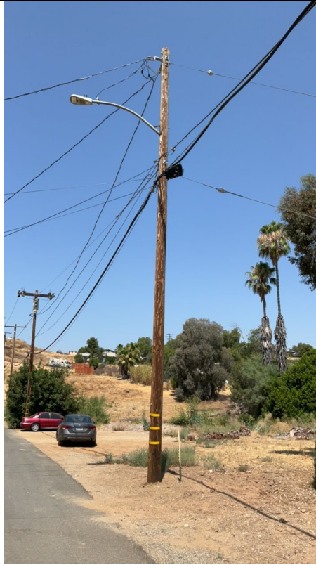
Item1IA1img1: No covered conductor present