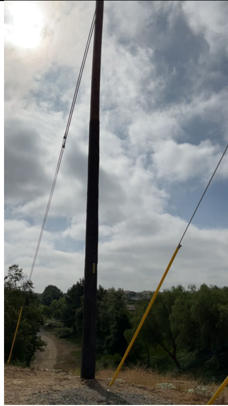
Item1IA1img2: No Covered Conductor on this pole