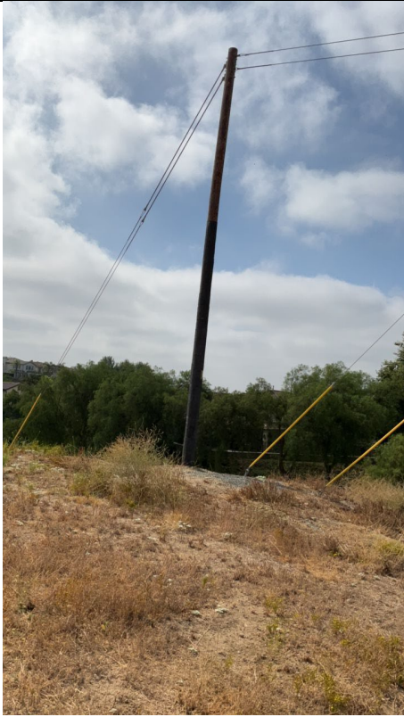
Item1IA1img1: No Covered Conductor on this pole