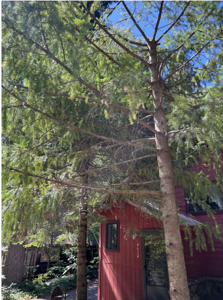
2- After Corrective Action