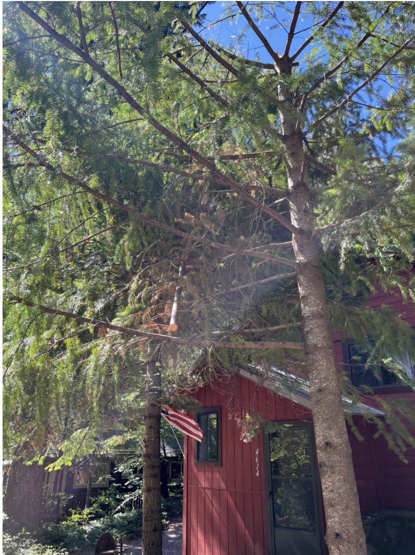
1 - Before Corrective Action