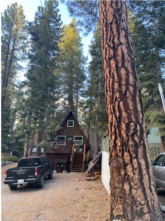
Photo showing that tree attachment and dead tree have been removed:

Map depicting location of removed tree and tree attachment: