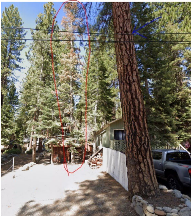
Photo showing dead tree and related tree attachment prior to removal:

Liberty Response 1 - Liberty disagrees with Energy Safety’s observation that it failed to complete the removal of a tree attachment on pole ID 291897 that it reported in its Quarter 3 and Quarter 4 2022 spatial data report. Liberty did complete that tree attachment removal as reported in its Quarter 4 2022 spatial data report. The photos below identify the completed work at the pole ID 291897 location. Energy Safety states that “Energy Safety understood Liberty Utilities’ QDR submission to mean that all tree attachments would be removed from this location.” 2 However, Liberty’s QDR submission reported only one tree attachment removal completed at this location.