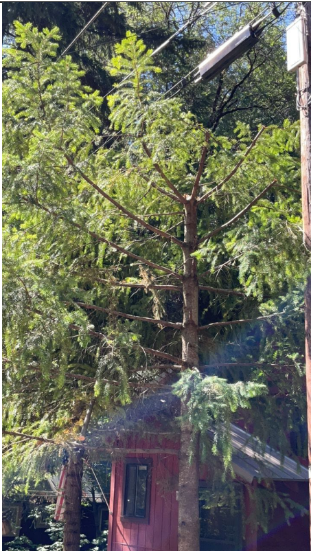
Item1IA1mg2: Douglas fir trimmed with branch left in canopy (lower left corner of image).