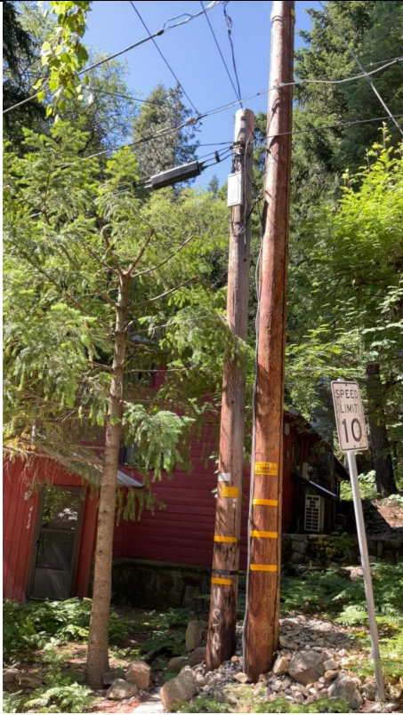
Item1IA1mg3: Douglas fir near pole ID 131040