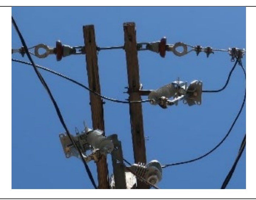
Item7IA1Img1: Overall view of one expulsion fuse and one Cal-Fire exempt fuse