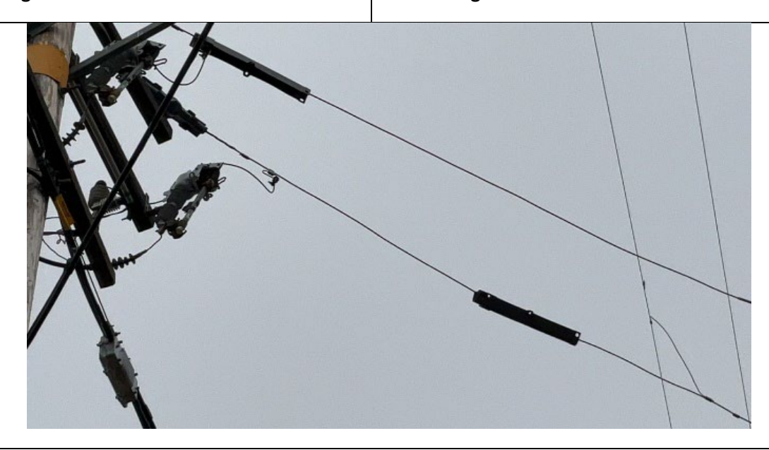
Item1IA1Img1: Dislodged avian protection cover