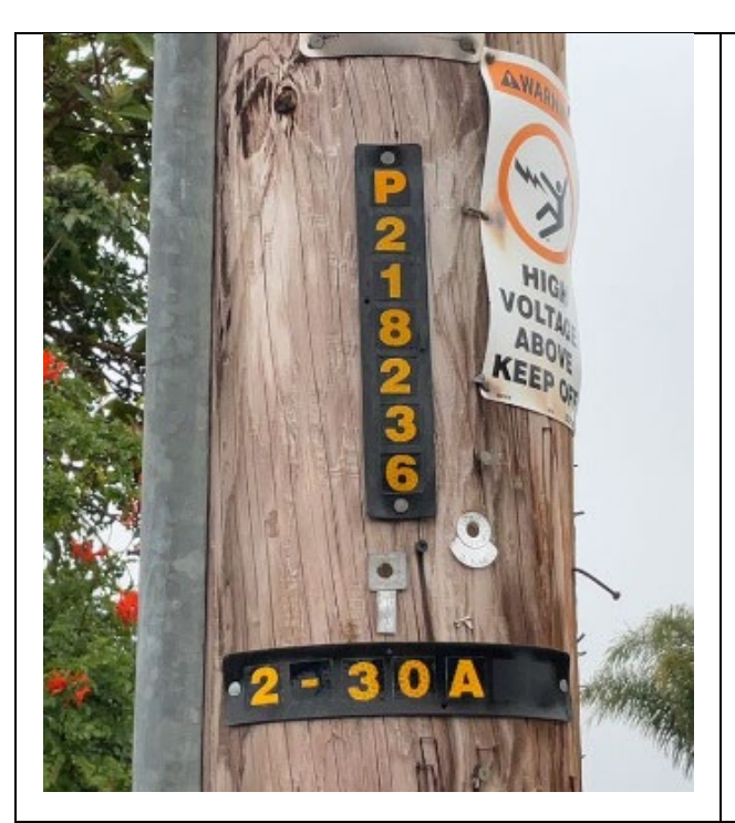
Item1GImg1: Pole ID