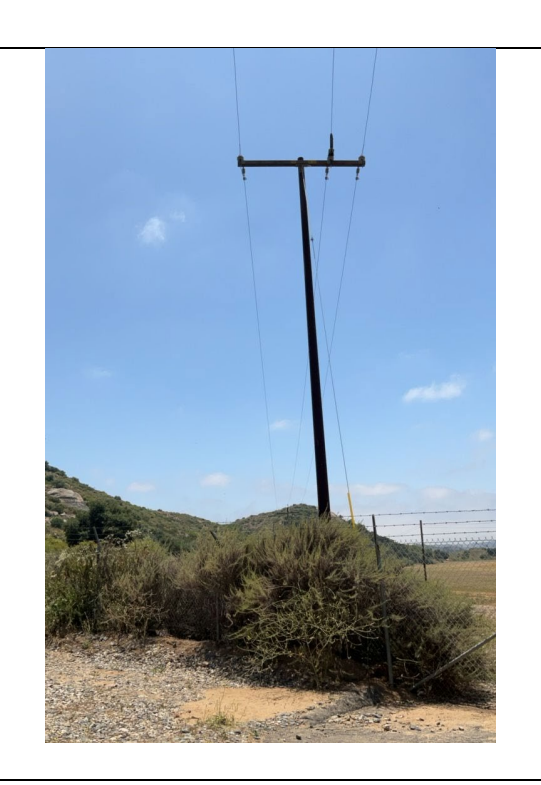
Item5GImg2: Overall pole