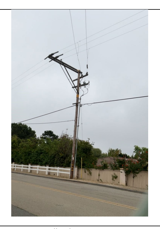
Item1GImg2: Overall Pole