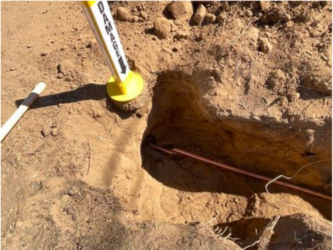
Photo 1 depicts the severed natural gas line.