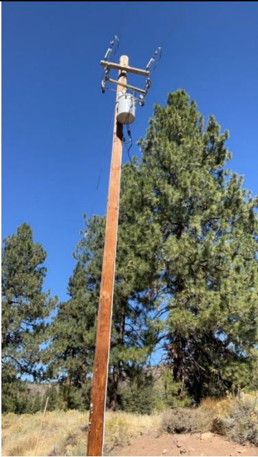
Item1Gimg1: Overall pole.