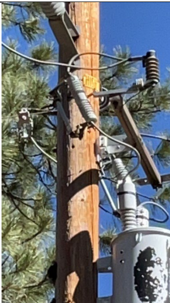
Item2GImg3: Close-up view of expulsion fuses.