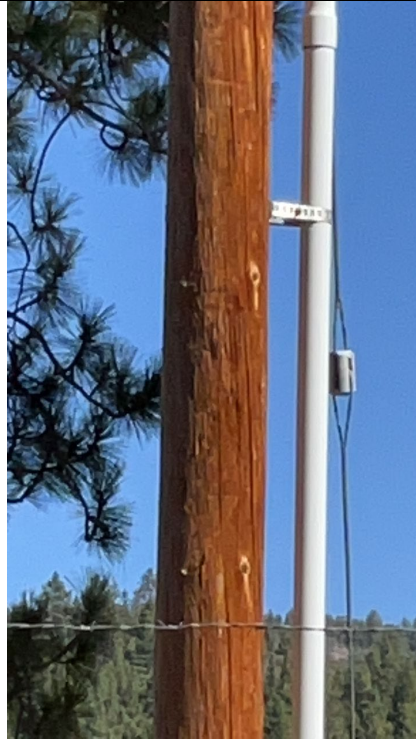
Item2GImg2: Pole ID not on the pole.