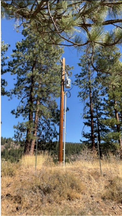
Item2GImg1: Overall pole.