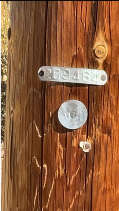
Item1Gimg2: Pole ID.